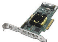
Adaptec RAID 5805 8-port, PCIe, RAID 0, 1, 1E, 5, 5EE, 6, 10, 50, 60