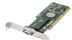
Adaptec RAID 48300 8-port, PCI-X, RAID 0, 1, 10 and JBOD