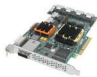
Adaptec RAID 52445 24+4-port, PCIe, RAID 0, 1, 1E, 5, 5EE, 6, 10, 50, 60